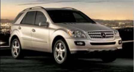
33 M-Class in stock. Starting from $36,500