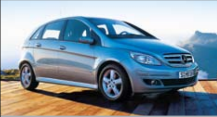
45 B-Class in stock. Starting from $19,900