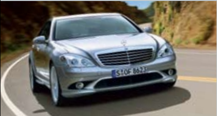
15 S-Class in stock. Starting from $42,800

Mercedes-Benz CERTIFIED mbtoronto.ca/thornhill