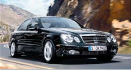
25 E-Class in stock. Starting from $34,500