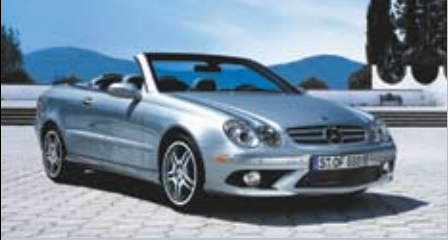
18 CLK-Class in stock. Starting from $35,500