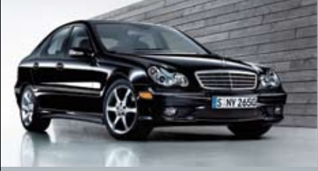
38 C-Class in stock. Starting from $23,500